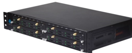
DWG2000G-32G/C-M (Built in 4-1 Antenna Power Divider)