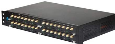
DWG2000G-32G/C (Standalone Antennas)